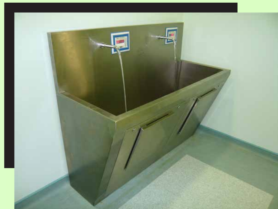
Robust Construction with electronics control

Innovative Design in Medical Engineering