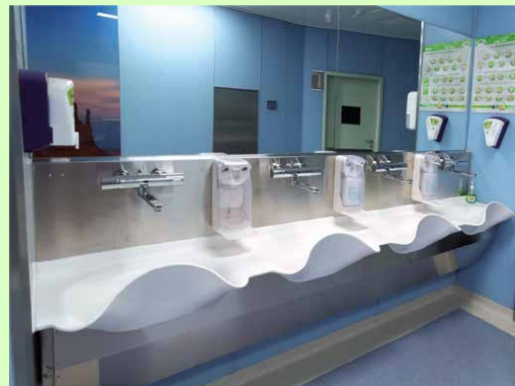
Dupont Material Construction Model